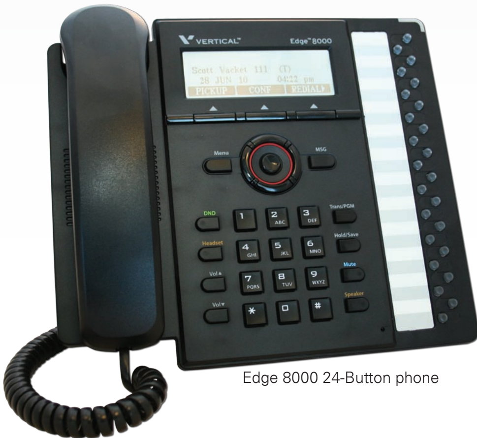
Edge 8000 24-Button phone

MBX IP can take advantage of T1 or PRI trunks to provide cost savings and functionality traditional analog trunks don't offer.