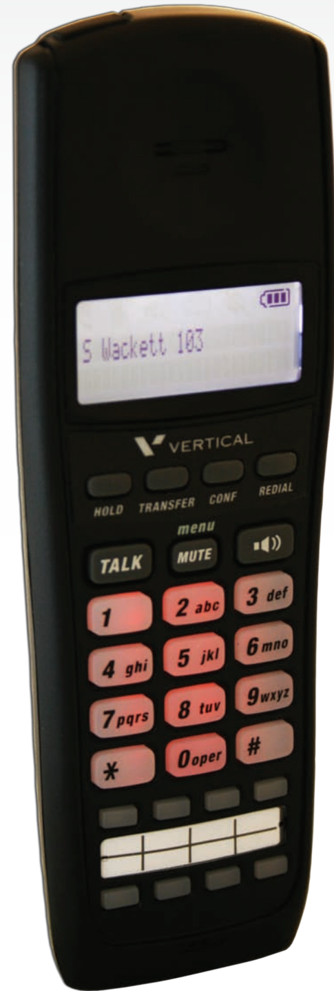
DECT cordless phone